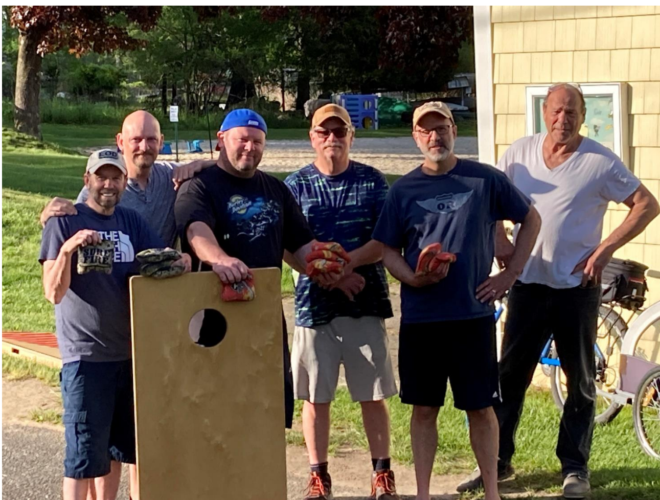
CORN HOLE TEAM PAUSED FOR A PHOTO OPPORTUNITY