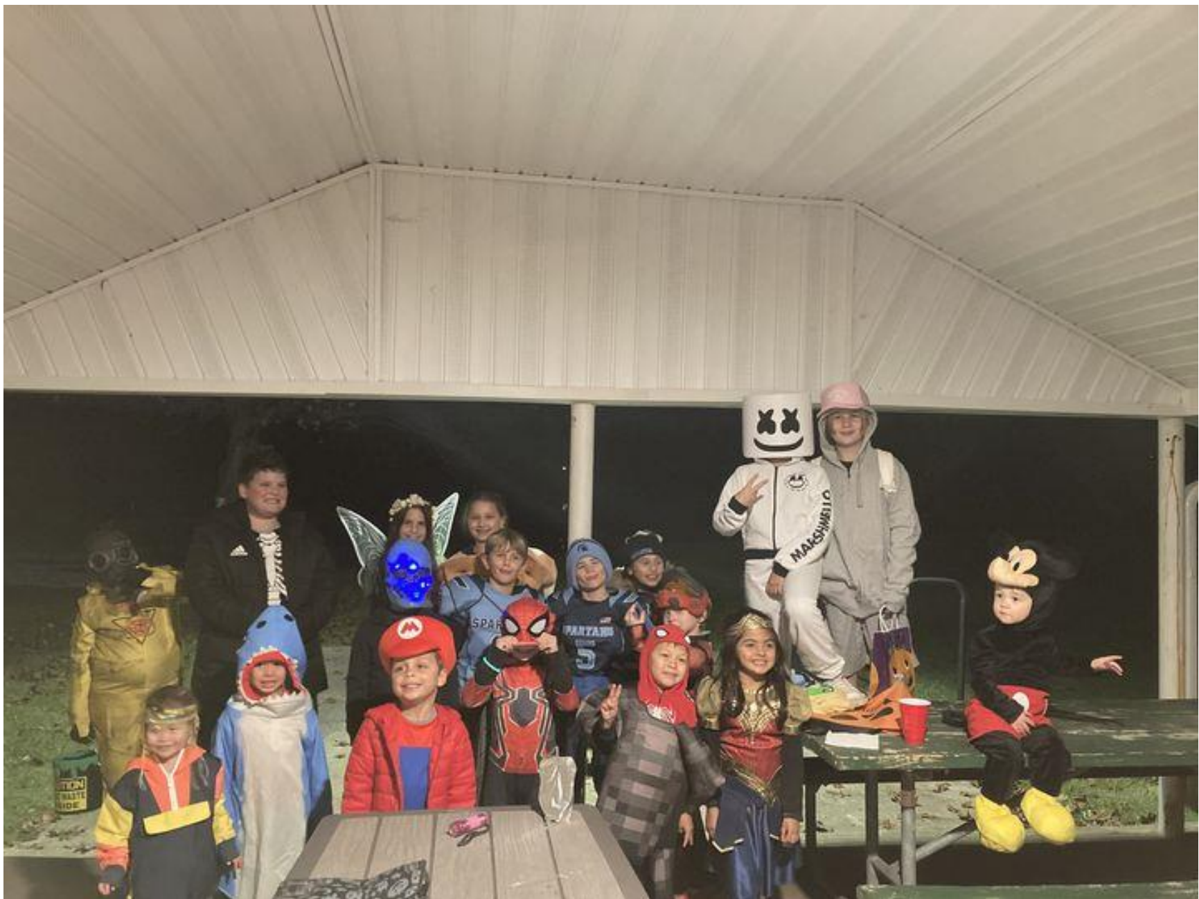
Spooky how some kids appear and disappear in a photo

HALLOWEEN TRICK OR TREAT EVENT WAS A HUGE SUCCESS!