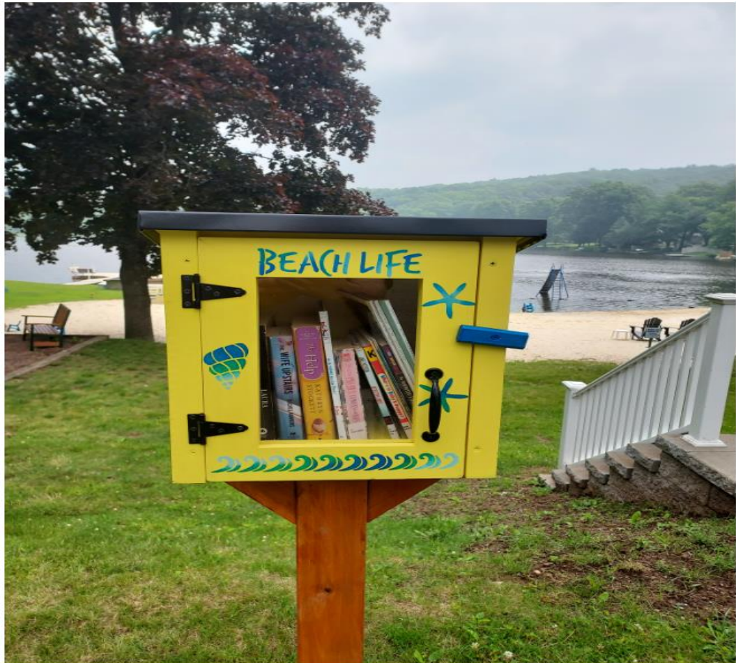
Little Library - Take a book...Leave a book...anytime

We hope you will soon enjoy the beach, the playground, fishing off the docks, or spending time at one of the club's activities and events.