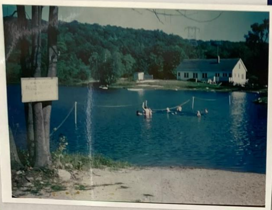
Early days at the beach club.